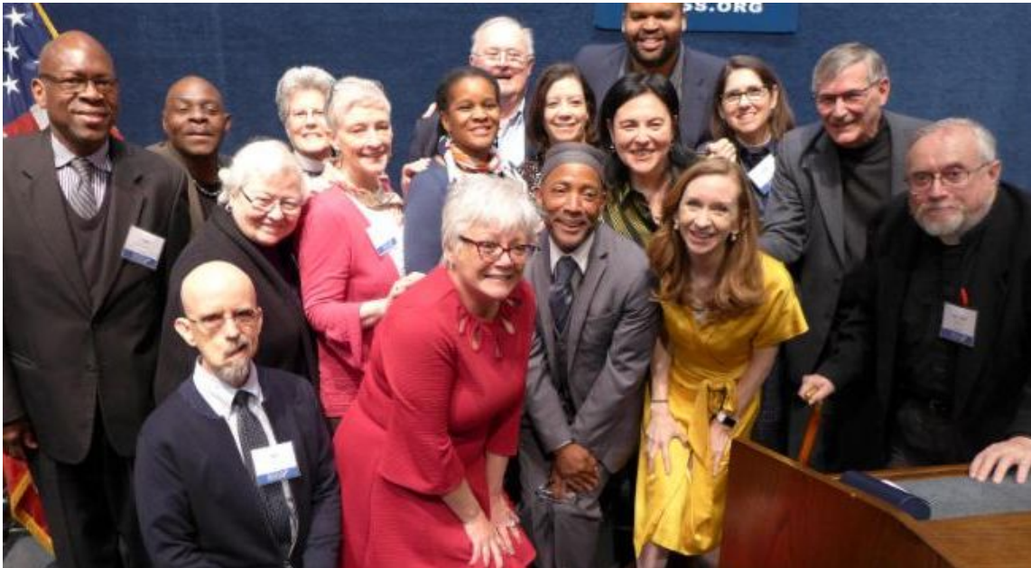
Above: Guests, speakers and musicians celebrate together after this year's Next Step Breakfast .