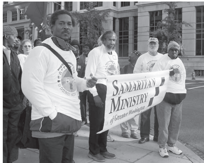
Worshippers from Church of the Epiphany's Welcome Table Service carry the Samaritan Ministry banner during the Help the Homeless mini-walk sponsored by the church. Over 100 people participated in the mini-walk.

Based on financial statements audited independently by Kronzek, Fisher & Lopez, PLLC, Certified Public Accountants