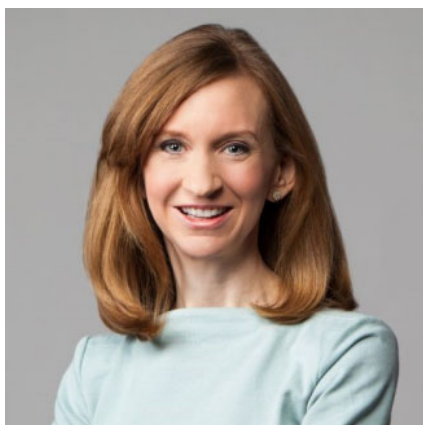
Lisa Desjardins PBS NewsHour Correspondent Emcee